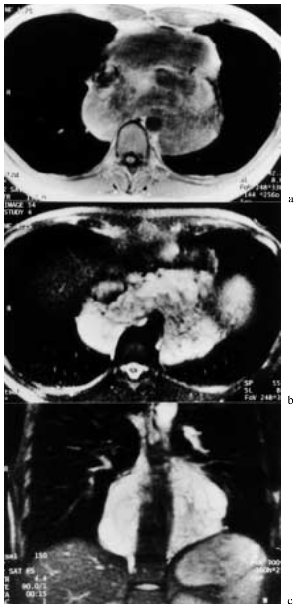
Fig. 1. a: T1-weighted MR image showed a mainly low-intensity signal but partially faint high-intensity signal, from which mucoid matter was suspected. b, c: T2-weighted MR image showed a mostly high-intensity signal, revealing the the multilocular septum within the mass.