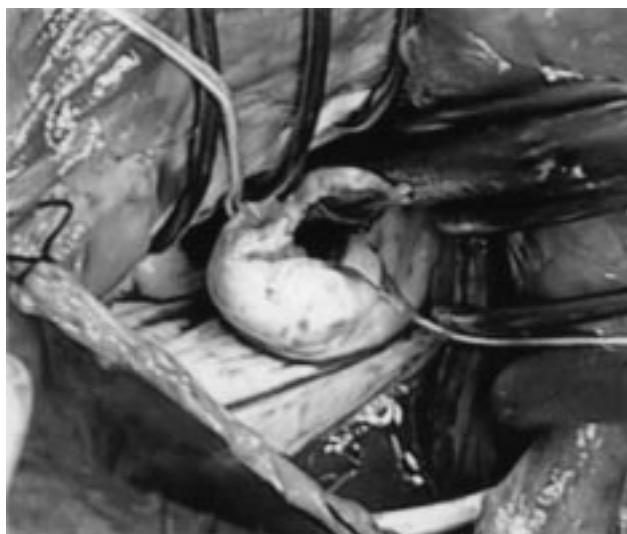
Fig. 2. Intraoperative view.

After a median sternotomy, transesophageal echocardiography (TEE) and an epi-aortic manual search found a small area without calcification on the aortic arch; this spot was chosen as the cannulation site. After VF had been induced by systemic moderate hypothermia, the mitral valve was exposed using a transseptal approach. Mitral valve repair was performed by a quadrangular re-