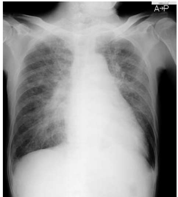
Fig. 2. Chest X-ray photograph. The cardiothoracic ratio was increased (62%), and pulmonary congestion was noted.

an intravenous drip of fluconazole at 400 mg/day was initiated. Aortic and mitral valve replacement for IE was performed 34 days after admission. Extracorporeal circulation was established by blood withdrawal via the superior vena cava and inferior vena cava and supply from the ascending aorta, and antegrade cardioplegic solution was infused. Under cardiac arrest, the ascending aorta was incised, and the valve was examined. In the right coronary cusp, vegetation measuring 3.5 \times 4 mm was noted (Fig. 3), and aortic valve replacement was performed. When the mitral valve was examined, extensive valve cusp deviation with rupture of the tendon at the anterior cusp was observed (Fig. 3). Mitral valve replacement was performed. Pathological examination showed zony fibrosis and myxoid degeneration and fibrin adhesion with neutrophil infiltration, suggesting vegetation formation in a portion of the two valves. No strain of streptococcus oralis was detected. Neither mycelial threads nor conidia of T. asahii were detected.